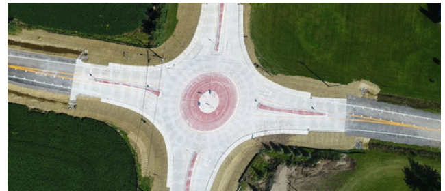
Roundabout at Morrish Rd. & Lennon Rd.