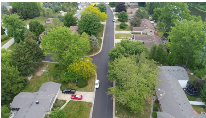
Golden Shores SAD

Hill Rd. signal upgrades Genesee Rd. bridge reconstruction Grand Blanc Rd. widening Flagstone Pointe SAD Lapeer Rd. reconstruction Torrey Rd. bridge reconstruction Hogan Rd. bridge reconstruction Concord Green SAD Irish Rd. rehabilitation Torrey Rd. culvert Grand Blanc Rd. culvert Saginaw Rd. widening Brittwood Acres SAD