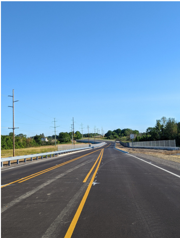
S. Dort Hwy.

S. Dort Hwy. extension Bristol Rd. (Atlas Rd. to Lang Rd.) Baldwin Rd. (Dort Hwy. to Holly Rd.) 5 roads in primary resurfacing package 14 roads in B-1 package Argentine Twp. culvert replacement 12 guardrail projects Seymour Rd. (north of Farrand) high-friction surface treatment Wyndemere Sq./Ct. SAD