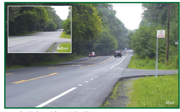
Lawyers Road, before and after a 2009 Road Diet

Reston, Virginia, a suburb of Washington, DC, is a planned community with a larger emphasis on non-motorized travel than many suburbs. The need for multi-modal accessibility has increased with the opening of a nearby rail transit station